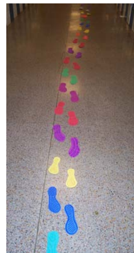
Elementary students traced their feet to make 100 footsteps down the hallway for the 100th day of school.

put his Spirit in me, because the LORD has appointed me to tell the good news to the poor. He has sent me to comfort those whose hearts are broken, to tell the captives they are free, and to tell the prisoners they are released. He has sent me to announce the time when the LORD will show his kindness and the time when our God will punish evil people. He has sent me to comfort all those who are sad and to help the sorrowing people of Jerusalem. I will give them a crown to replace their ashes, and the oil of gladness to replace their sorrow, and clothes of praise to replace their spirit of sadness. Then they will be called Trees of Goodness, trees planted by the LORD to show his greatness. They will rebuild the old ruins and restore the places destroyed long ago. They will repair the ruined cities that were destroyed for so long. My people, foreigners will come to tend your sheep. People from other countries will tend your fields and vineyards. You