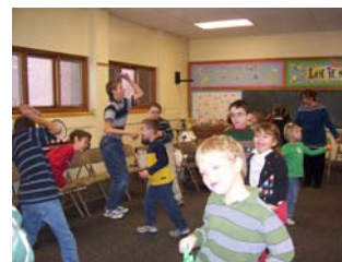
Elementary students dancing around during music class

Our field trip to Fort Wayne had to be cancelled because of the ice storm we got just before Christmas. We were disappointed that we didn't get to see the show "The Star of Bethlehem." This reporter hopes we can all go see it next year.